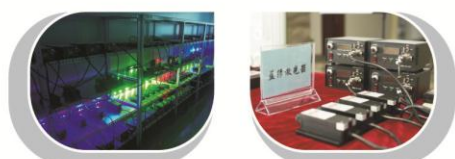
长春新产业光电技术有限公司 Changchun New Industries Optoelectronics Technology Co., Ltd. 各型激光器 Diode pumped all-solid-state lasers