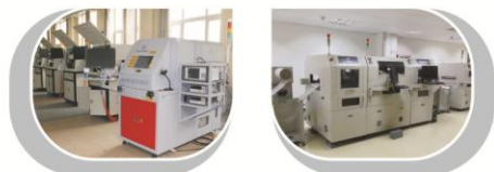
长春光华微电子设备工程有限公司 Changchun Guanghua Micro Electronics Equipment Engineering Center Co., Ltd. 激光调阻机、电子标签封装设备 Laser Trimmer, RFID Inlay Bonder