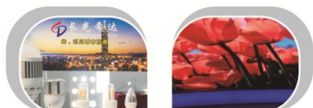
长春希达电子技术有限公司 Changchun Cedar Electronics Technology Co., Ltd. 高清LED显示屏、LED照明产品 High Definition LED Display Panel, LED Lights