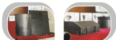
长春长光宇航复合材料有限公司 Changchun Aerospace Composite Materials Co., Ltd. 碳纤维复合材料 Carbon Fiber Composite Materials