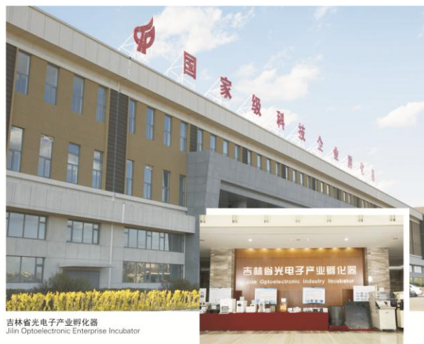
吉林省光电子产业孵化器 Jilin Optoelectronic Enterprise Incubator

从奇思妙想到技术研发的全过程培育 Thought-Technology 从技术研发到技术应用的全过程实现 Technology-Technology 从技术应用到市场转移的全过程服务 Technology-Transfer