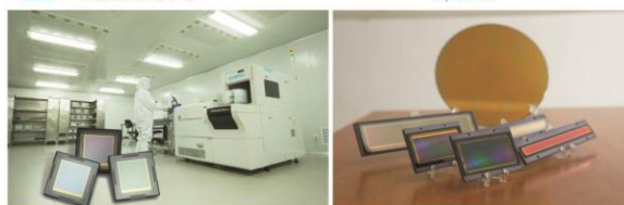
长春长光辰芯光电技术有限公司 Gpixel Inc.